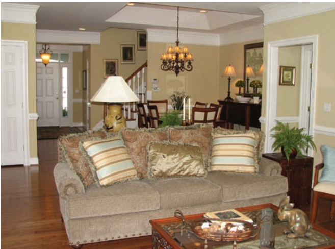
Living area looking into the Dining Area