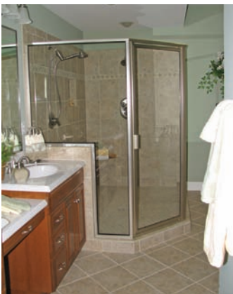
M. Bath with radiant heated tile floor and dual showers