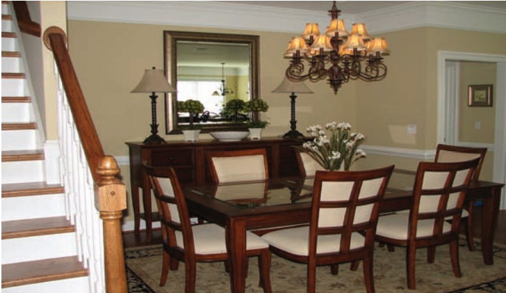
Dining area takes advantage of open floor plan

BUILT FOR LIFE Westhills Co. BUILDERS SINCE 1970