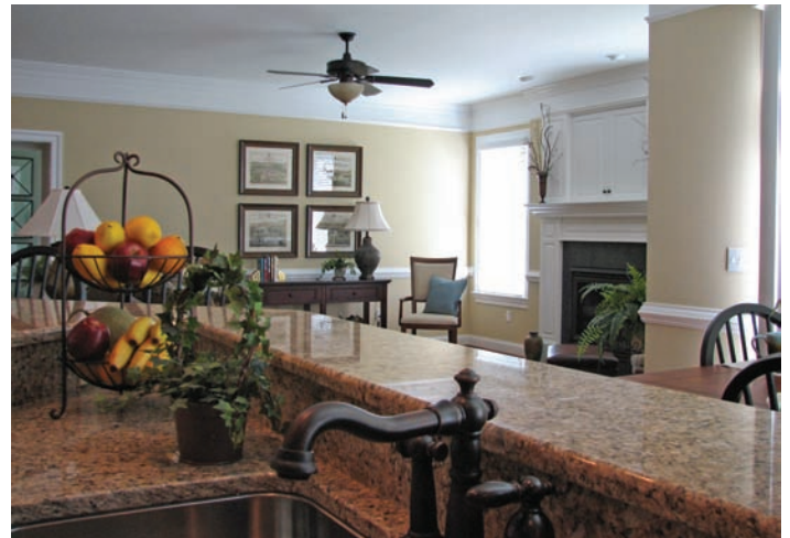
Kitchen looking into living area