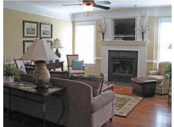
Living area with media center cabinet above gas log fireplace