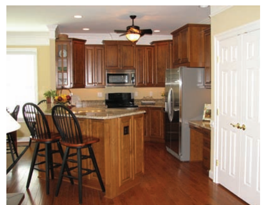
Custom Cherry Cabinets & Granite Counters in Kitchen

For more information or to schedule a showing, please call