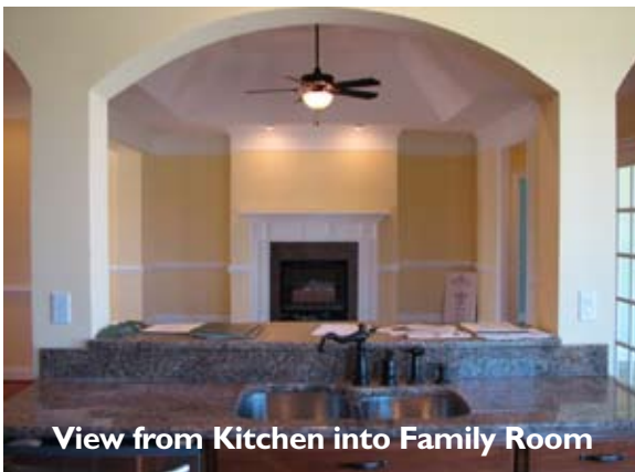
View from Kitchen into Family Room