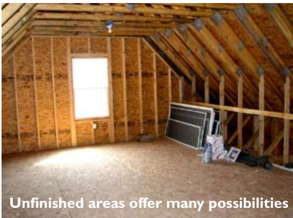
Unfinished areas offer many possibilities