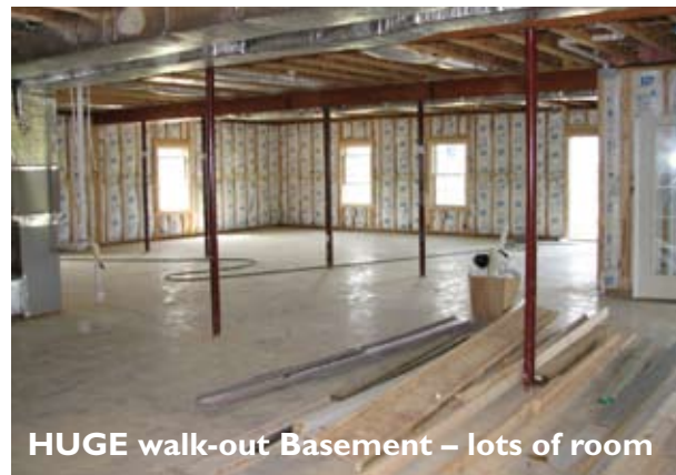
HUGE walk-out Basement – lots of room