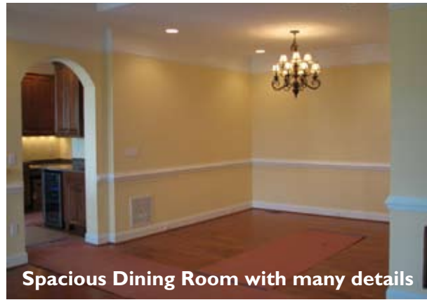
Spacious Dining Room with many details