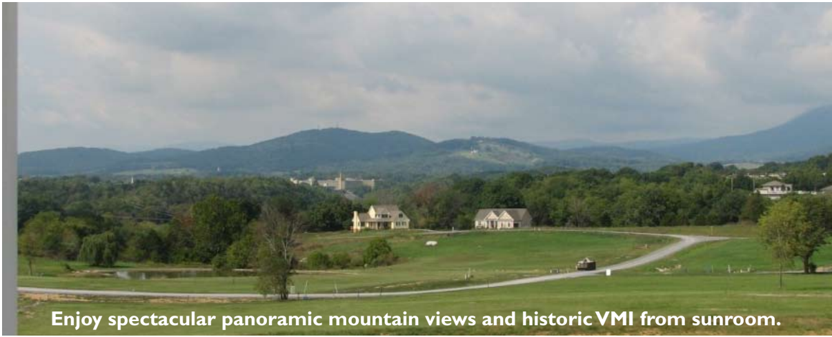
Enjoy spectacular panoramic mountain views and historic VMI from sunroom.