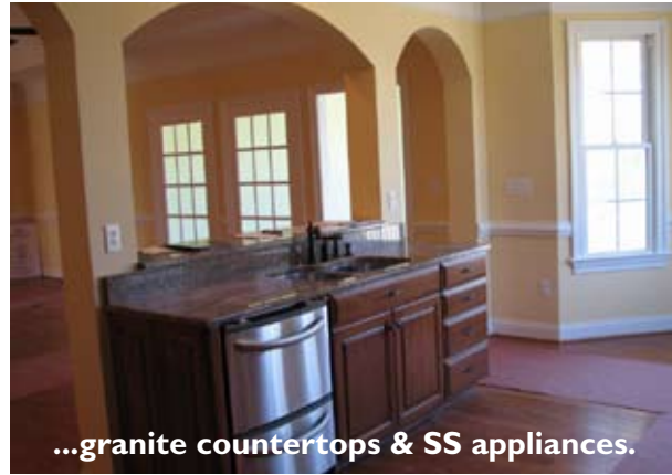
...granite countertops & SS appliances.