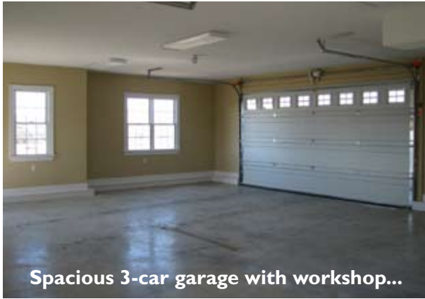
Spacious 3-car garage with workshop...