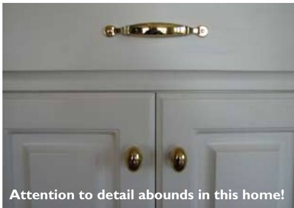
Attention to detail abounds in this home!