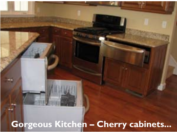
Gorgeous Kitchen – Cherry cabinets...