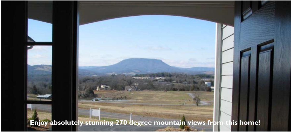
Enjoy absolutely stunning 270 degree mountain views from this home!