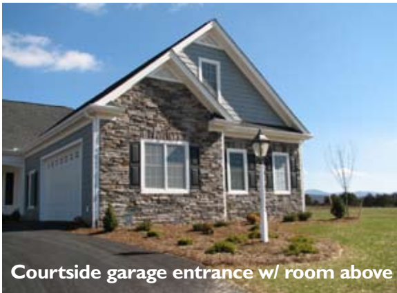
Courtside garage entrance w/ room above