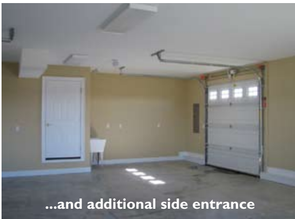
...and additional side entrance