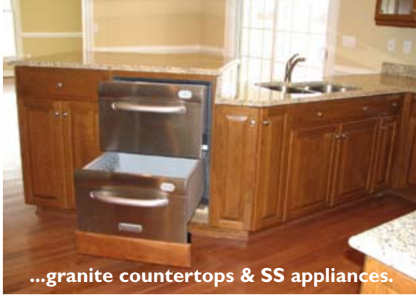
...granite countertops & SS appliances.