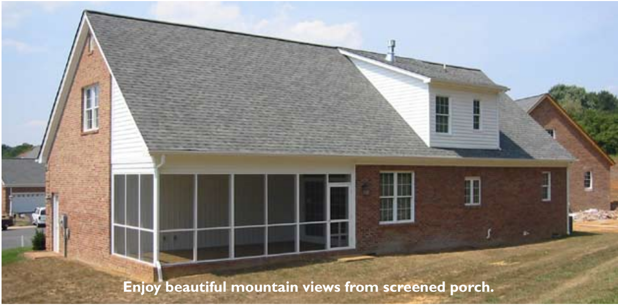
Enjoy beautiful mountain views from screened porch.