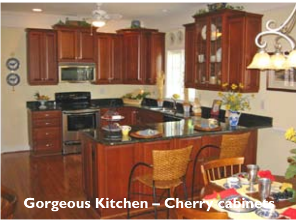
Gorgeous Kitchen – Cherry cabinets