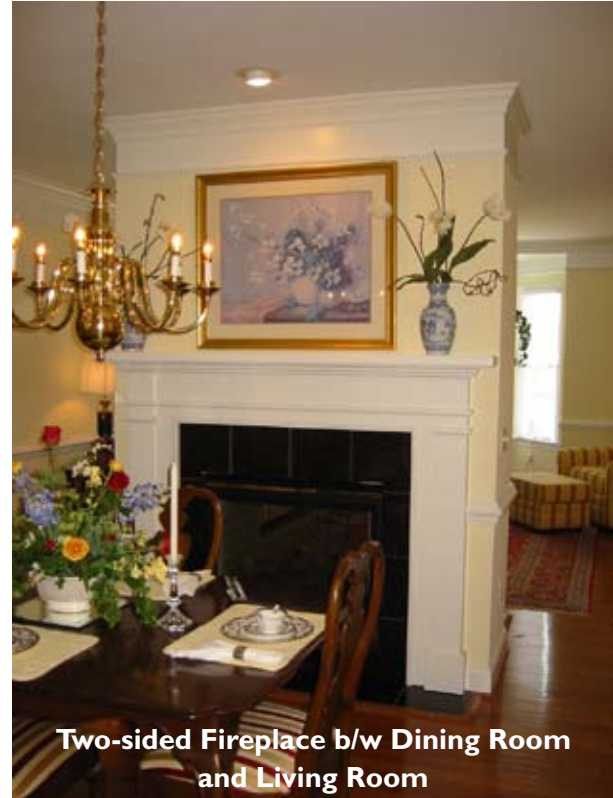
Two-sided Fireplace b/w Dining Room and Living Room