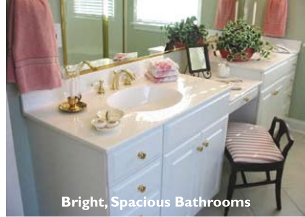
Bright, Spacious Bathrooms