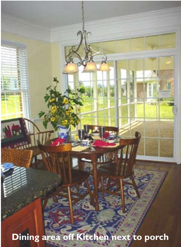
Dining area off Kitchen next to porch